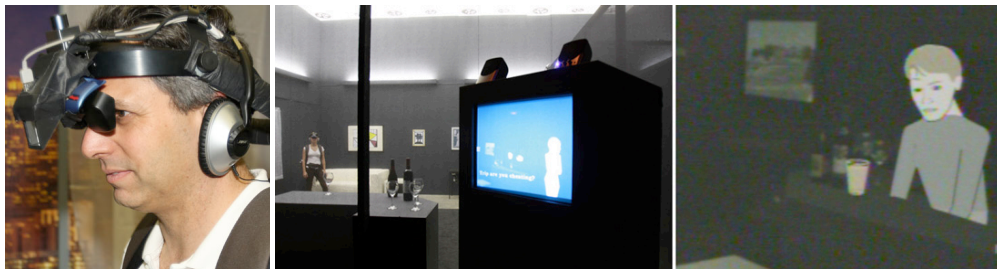
Fig. 1. (left) The head-worn display. (middle) Audience's view into the physical apartment with monitor showing the player's perspective. (right) Player's HMD view shows the Trip character standing behind the physical bar. Note that the black scrim blocks the view of objects beyond the wall.

AR Façade would be part of a free-to-the-public art gallery for 11 weeks, so we devoted a fair amount of time to the construction of the head-mounted display (HMD) (Fig. 1 left ) and the physical layout of the space (fig. 1 middle ). We constructed the head-mounted display from third-party components and custom-created mounts to be robust enough to withstand mishandling. We tracked the HMD using the IS-1200 Vistracker and large visual markers mounted on the 16' tall ceiling. Florescent lights lined the perimeter of the apartment at 10' high and provided an even distribution of light across the ceiling and enough illumination for the stage. We did not encounter any noticeable tracking problems—such as jitter and temporary loss of tracking data as we did with our initial prototype—despite losing a few markers from the ceiling.